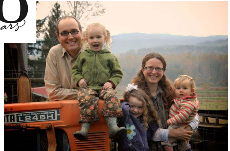
Close to Home Organics – Veggie Grower, Abbotsford