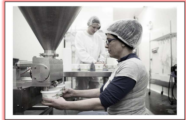
Local and Organic Food Tree Island Yogurt