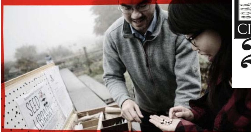
Richmond Food Security Society – Incubator Farm Project