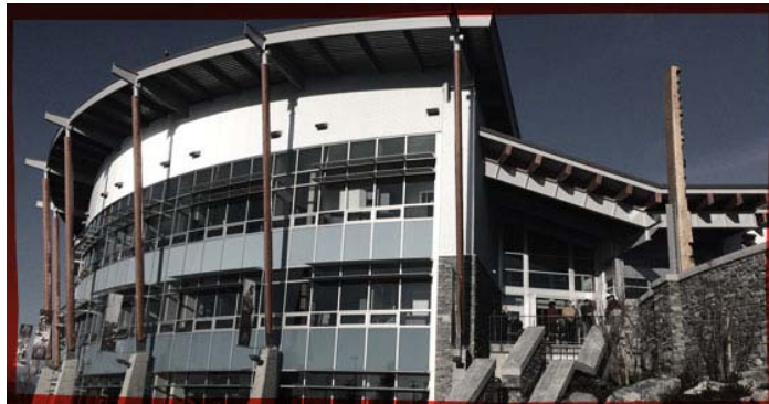
Aboriginal Communities Songhees House of Wellness