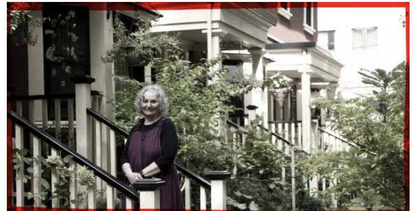
Affordable Housing Trafalgar Co-operative Housing Association